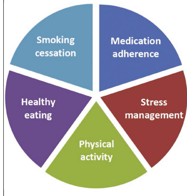
FIGURE 1 Target Health Behaviors for Cardiac Rehabilitation

patients over time. CR services empower patients to meet the goals of increased physical activity, improved dietary habits, optimal adherence to prescribed medications, smoking cessation, and optimal psychosocial well-being, thereby helping them to reduce their risk of future CVD events ( Figure 1 ).